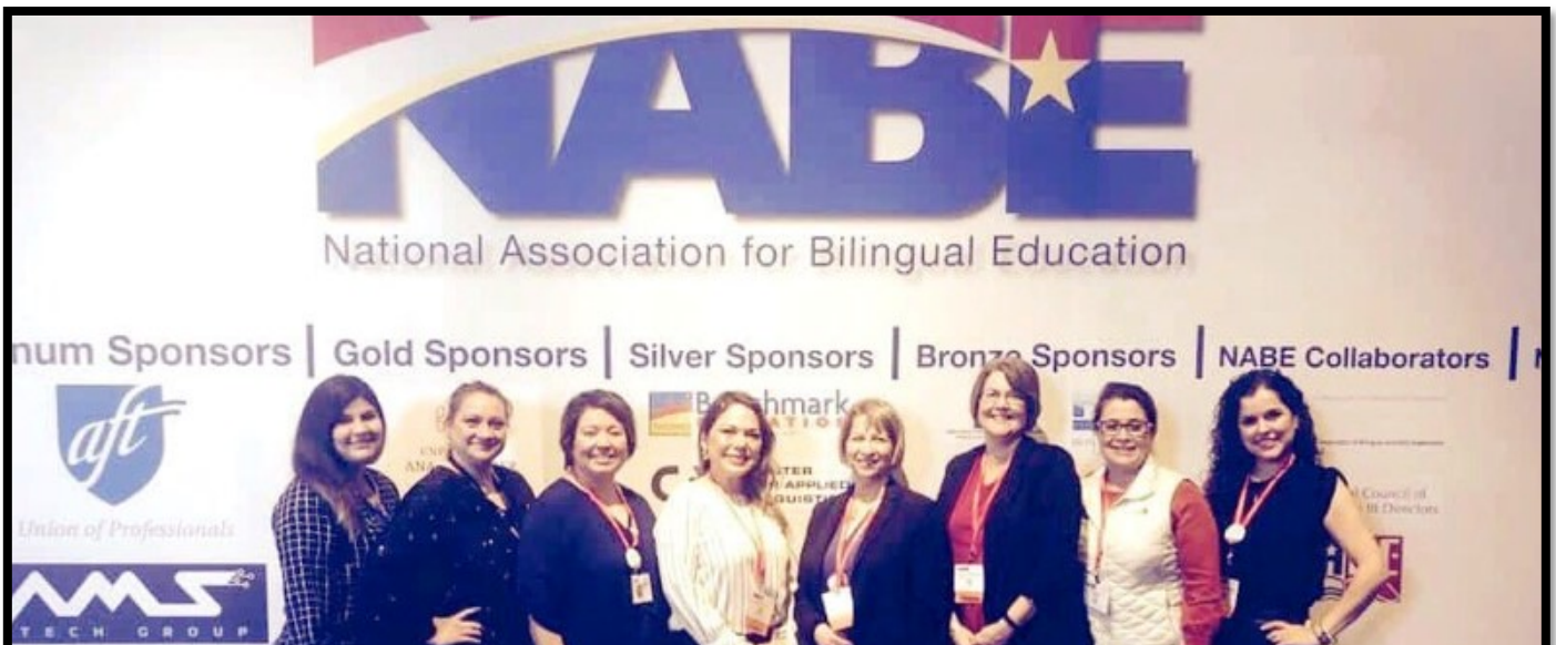
TABE Board Members attending NABE Conference 2019

I am happy to report that eight TABE Board members attended and presented at the 2019 National Association for Bilingual Education (NABE) Conference in beautiful Orlando, Florida in March 6-9. Presentation topics varied from current research projects to effective strategies that foster the development of biliteracy, bilingualism, and biculturalism. Texas was well represented at NABE; we saw many of our Texas bilingual educators presenting and attending the great sessions and keynote events.