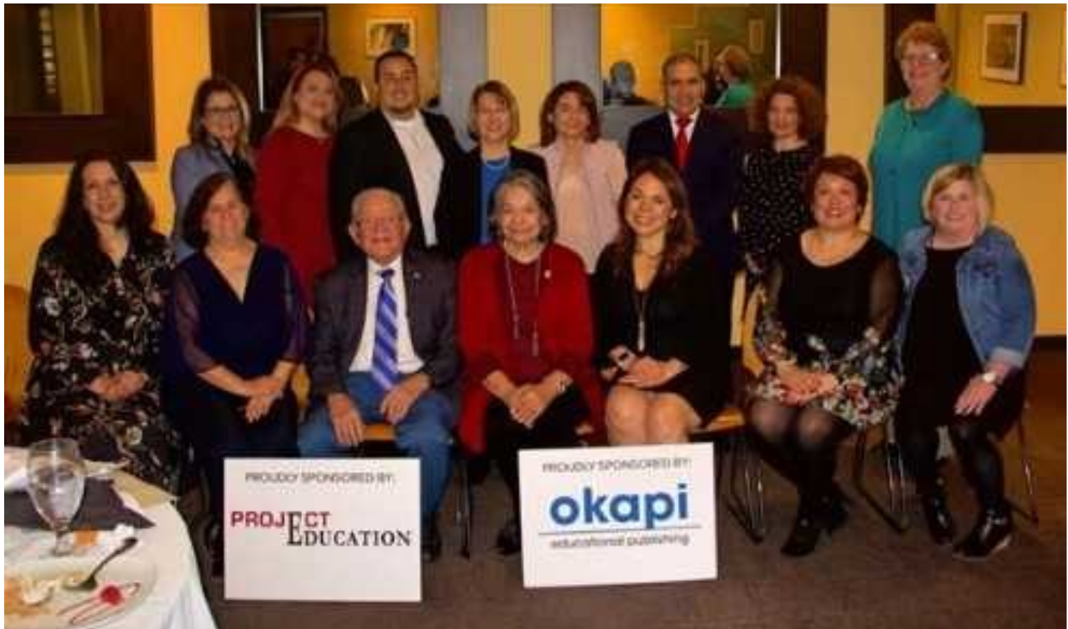
The new 2019 TABE Board Members